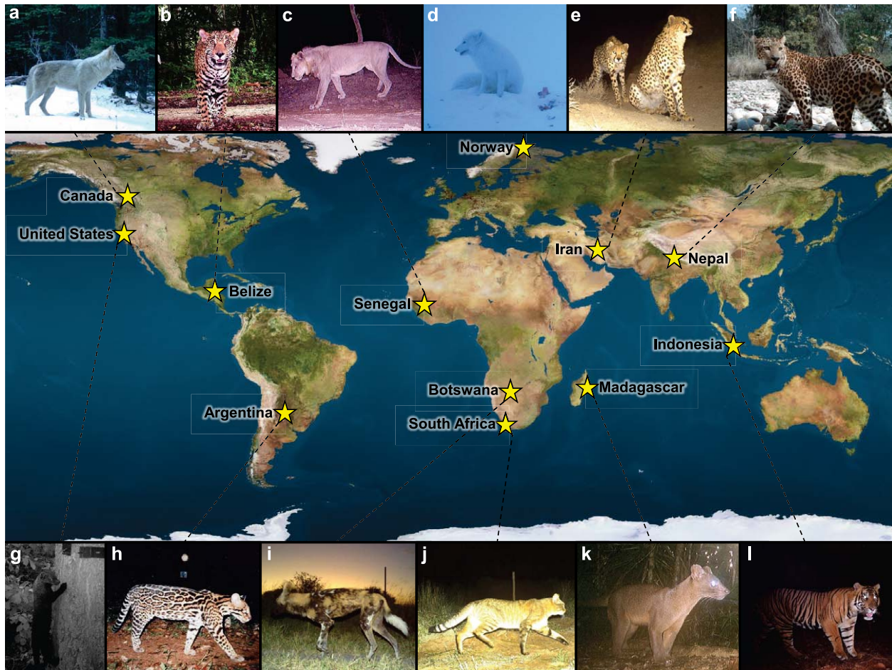
FIGURE 1 Relative locations of the local camera trap projects included in a global carnivore analysis. Examples of carnivores included in the study are as follows: (a) grey wolf ( Canis lupus), (b) jaguar ( Panthera onca), (c) lion ( Panthera leo), (d) arctic fox ( Vulpes lagopus), (e) Asiatic cheetah ( Acinonyx jubatus venaticus), (f) leopard ( Panthera pardus fusca), (g) fisher ( Pekania pennant), (h) ocelot ( Leopardus pardalis), (i) African wild dog ( Lycaon pictus), (j) wildcat ( Felis silvestris), (k) fossa ( Cryptoprocta ferox), and (l) Sumatran tiger ( Panthera tigris sumatrae)

coast of Finnmark in northern Norway (Hamel, Killengreen, Henden, Yoccoz, & Ims, 2013; Henden et al., 2014).